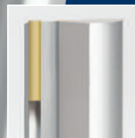
monocrystalline diamond edge